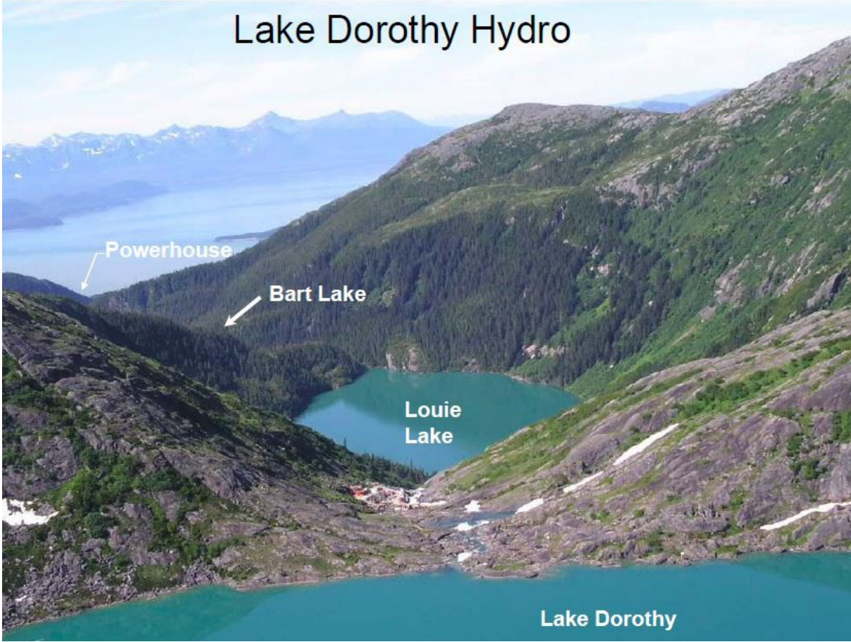
Lake Dorothy Portal on July 25, 2009