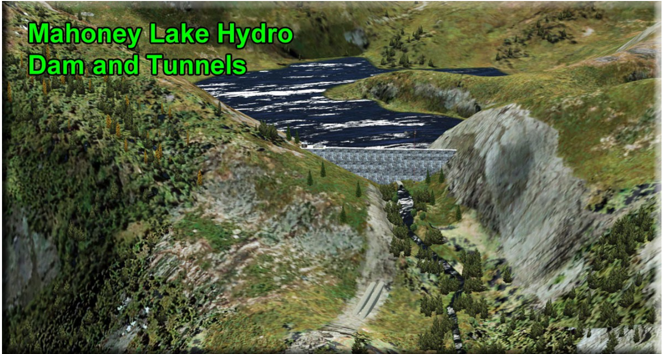
Mahoney Lake Hydro Dam and Tunnels

The dam is being constructed on Upper Mahoney lake some 600 meters above the proposed powerhouse. Two tunnels will bring the water down from the dam to the powerhouse. There presently is a river coming down the mountain from Upper Mahoney Lake to Lower Mahoney Lake. About half way down is a waterfall. The turbine plant will be at lake level below the waterfall.