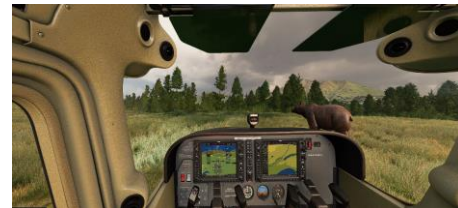
Long Lake (4AK3)