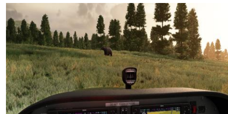
Bear at Long Lake