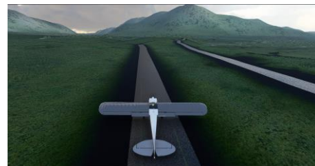
Horsfeld (Not much here!)