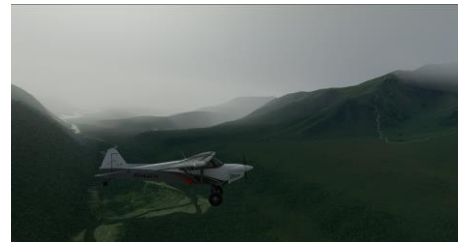
Heading to Beaver Creek