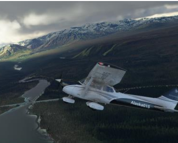
On the way to Silver City