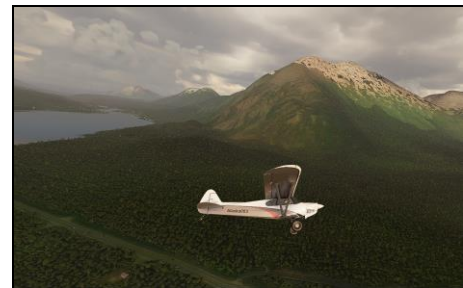
Enroute to Seward