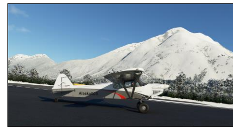
Quartz Creek (Winter)