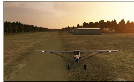
Departing Beluga (PABG)