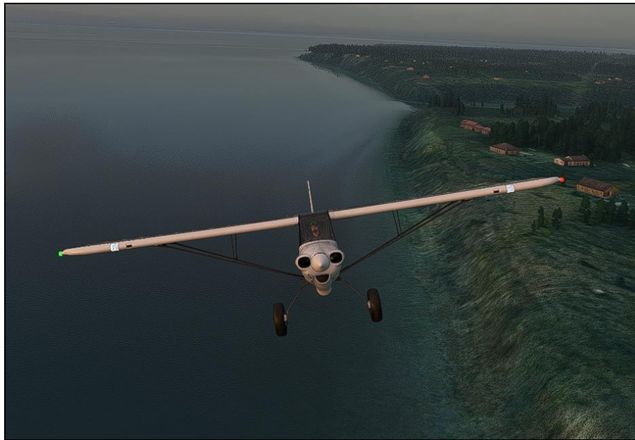
Hope all enjoy this MSFS expedition exploring some of the sites in Alaska.

NOTE: For those of you who don't like "missions" per say, I have included the flight plan (both LNM and MSFS version) on which this bush trip is based as well as have included a sky vector map link for those who might want to remove any automated nav aids and navigate via static map, dead reckoning and marking land marks to ascertain position. (But make sure you grab your watch or E6B just in case: don't want to get lost!)