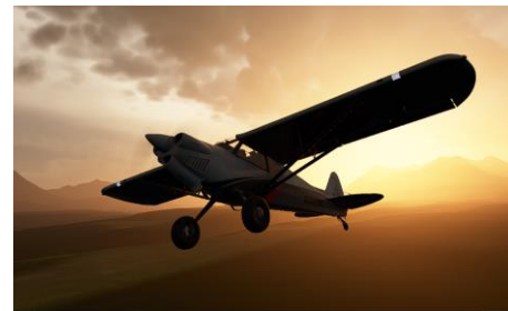
Enroute to Bluff Park Farm (71AK)