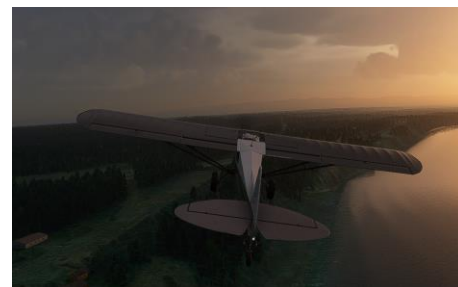
Following the Knik Arm (Northeast extension of Cook Inlet)