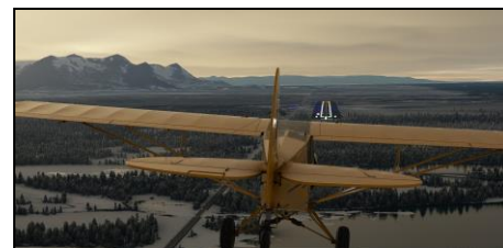
Short Final Cordova Rwy 09