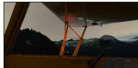
Valdez Glacier (Approach to PAVD)