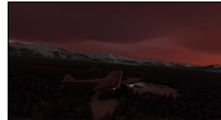
Navigating Mountainous Terrain