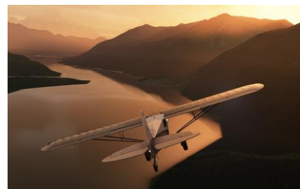
Following Miles Lake/River